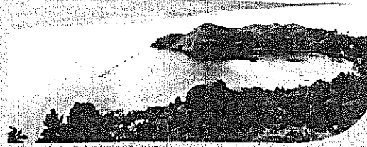
Danau Toba, Medan