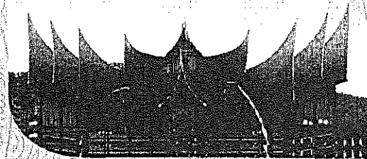
Rumah Gadang, Padang